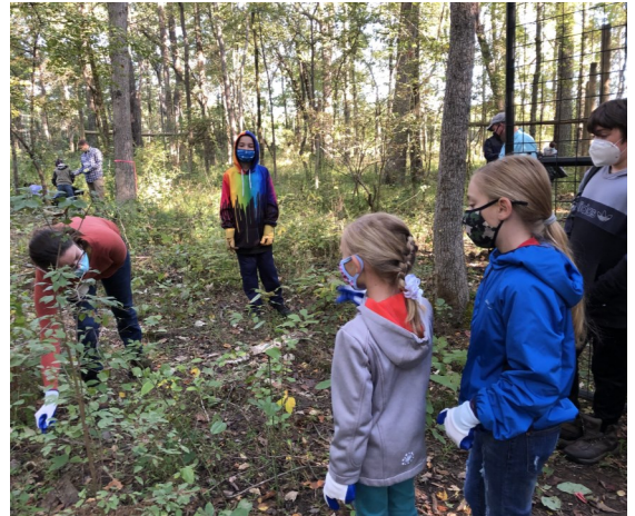
Volunteers removing invasive plants in Leopold's Preserve's Deer Enclosure!

It also provides a unique opportunity for some professional networking. Volunteering can allow you to meet folks in different careers or professions and learn more about that field. Depending on your company, you may also have community service corporate benefits, or contribution matching based on volunteer hours. If you don't have much job experience, volunteering is a great way to accrue both hard and soft skills.