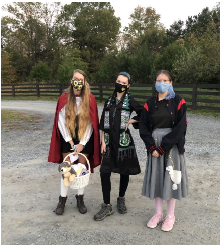
Halloween Safari Volunteer Trail Guides!

All in all, volunteering is more than just spending your Saturday cleaning garbage and debris out of an old house (which is one of our volunteer projects this year!). It's an opportunity to grow both individually and professionally and connect with the community around you. There are so many ways to be involved as a volunteer that anyone can be involved in some way.